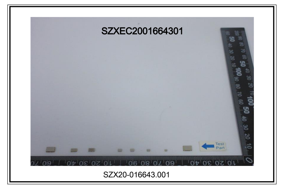
SGS authenticate the photo on original report only